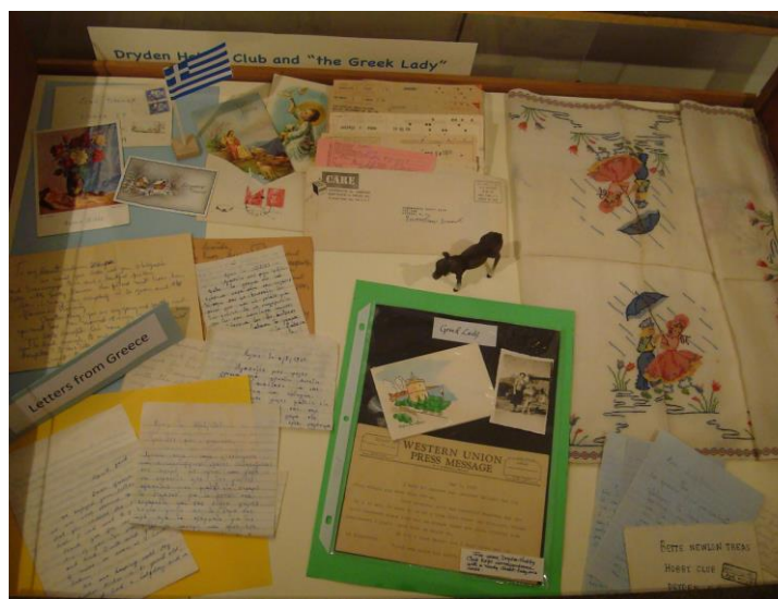
Letters, cards, photographs, and needlepoint table cloth, are shown in "Dryden Hobby Club and the Greek Lady" DTHS mini exhibit