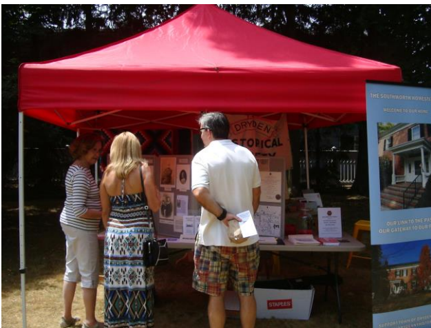
This past summer, DTHS was everywhere. The mini display about the Dwight family and Dryden Historical District was a big hit at the Beautification Open Gate Garden tour held on July 16. DTHS.