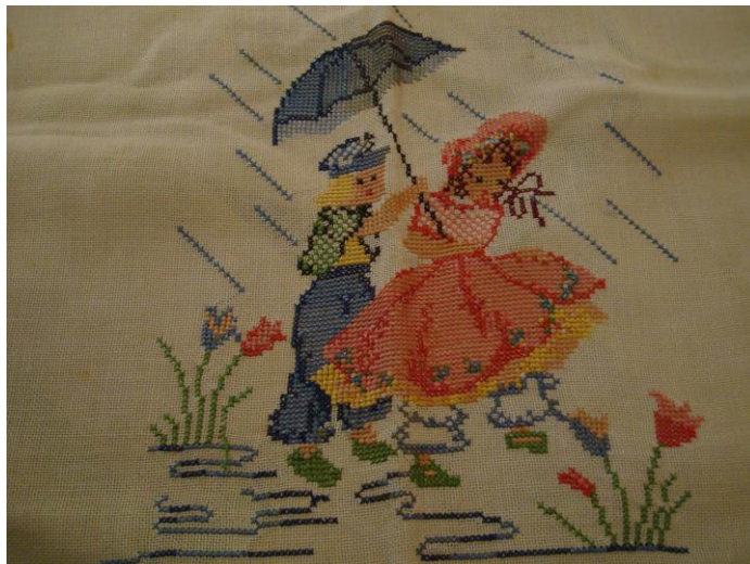
Detail from needlepoint tablecloth from Greece, ca 1948. the Dryden Hobby Club corresponded with the Greek Ladies family, 1946 - 1974

In 1974 the club decided to discontinue sending packages writing to tell the family that the club was no longer able to send packages.