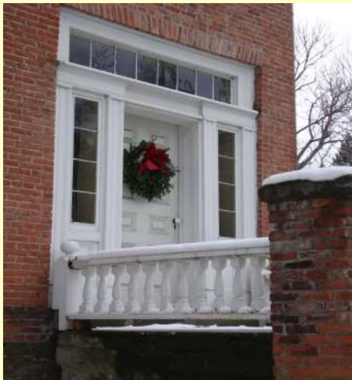
Southworth House wreath, west side