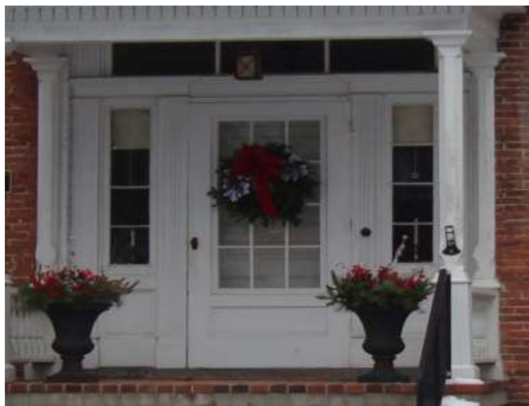
Southworth House south entrance wreaths and filled urns

Bob Watros hangs the wreath on the lower level door