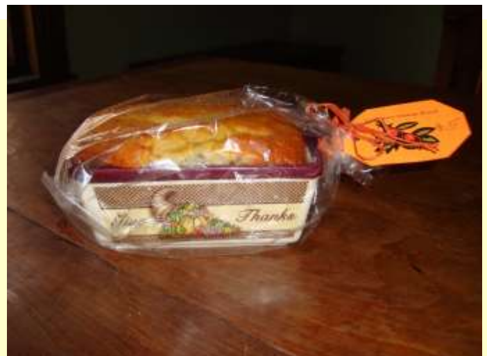
One of the beautiful loaves for sale. Many thanks to all who made DTHS 2014 Pie and Bread sale a huge success.

All proceeds benefit the Southworth Homestead.